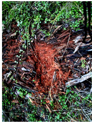
What the resident believes was a footprint made by the subject.