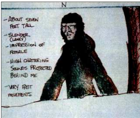
Drawings provided by the resident.