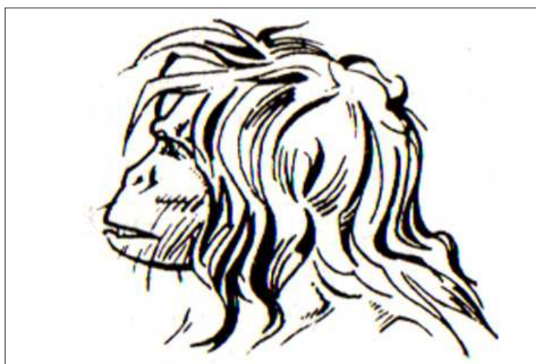
Drawings of an almasty based on and eyewitness account.

who in treating some of the Mongols in a very remote area, met an almas family, so there seems to be no doubt the creatures are there. They seem to be rather short, stocky, and to be very shy, and it's also mentioned in many stories that they are rather hairy and have very primitive clothes. In this respect the description of Neanderthal man fits the almas really quite well.