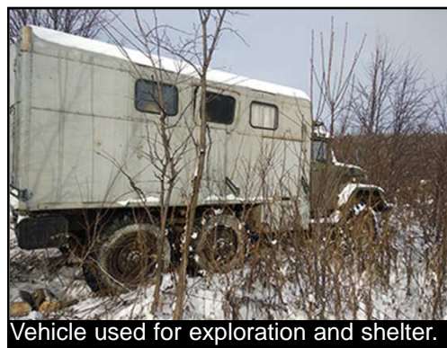
Vehicle used for exploration and shelter.