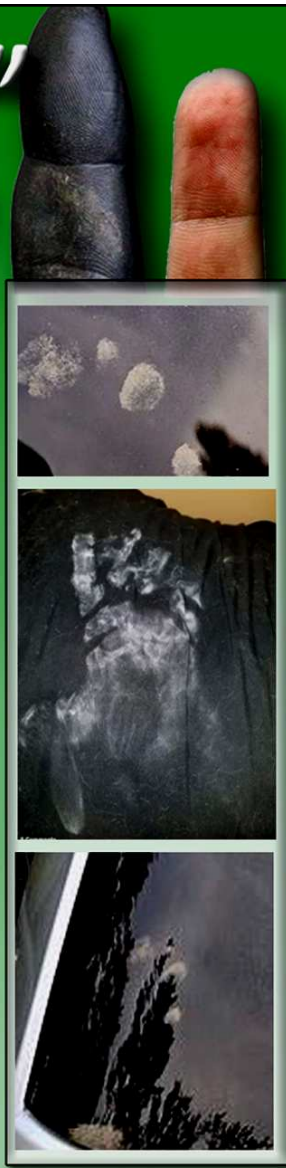
All photos used under the fair use doctrine for scientific purpose

- In Discussing this with Researcher's Michael Waldie & Shelly Covington-Montana about this situation concerning a white face print left on glass, she decided to coin the new Citizen Science term to describe this material as: "Sasquatch Alba Vernix" Alba means white and Vernix is the thick waxy oil like substance Babies are covered in when in the womb, it is a highly protective material. Please contact Shelly through Facebook for more info and proper collection kits. After careful photography, It may be historic to collect it for future analysis for both chemical compounds and DNA. Plus the print and friction ridges have scientific importance. I can also be contacted through Facebook. Kind Regards, Doug Hajicek