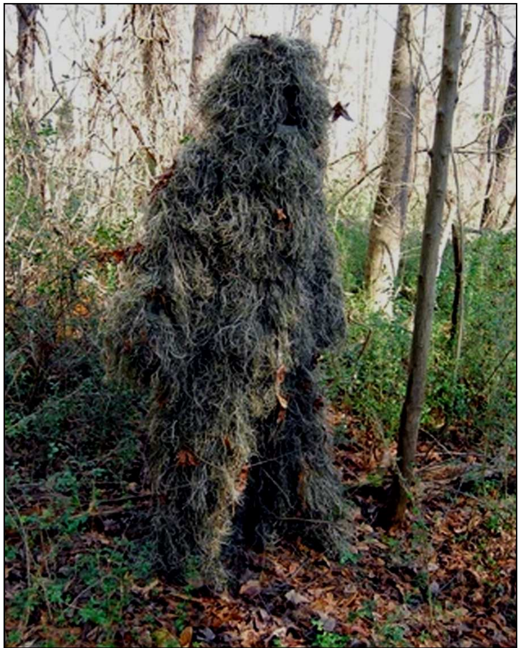
Man in a ghillie suit: A ghillie suit is a type of camouflage clothing designed to resemble the background environment such as foliage, snow or sand. Typically, it is a net or cloth garment covered in loose strips of burlap (hessian), cloth, or twine, sometimes made to look like leaves and twigs, and optionally augmented with scraps of foliage from the area. (Wikipedia)

In reading about bigfoot encounters over the last 200 years there have been at least two instances where the hominoid has been shot and said to have been killed, but the bodies were not retrieved as proof. Usually, it has been brought