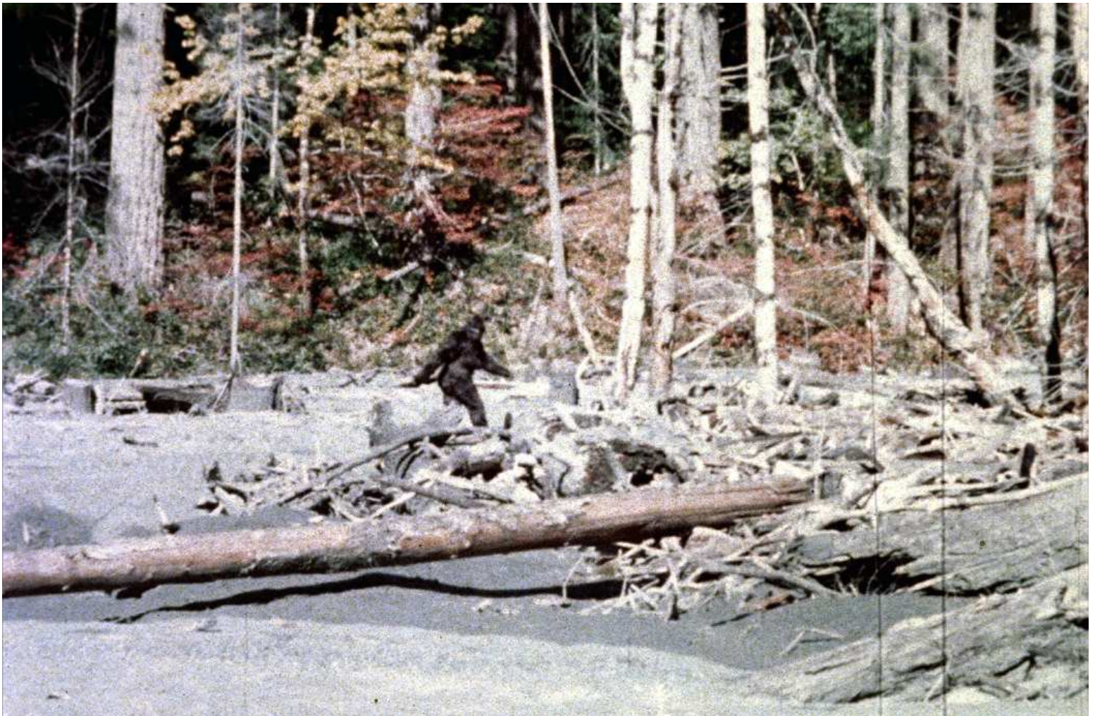
A full movie frame (frame 353) from the Patterson/Gimlin film.

He's not sure how much longer they will remain in the area. "It all depends."