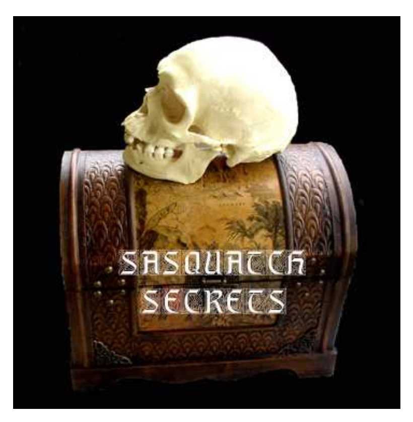
The following are "unusual" notes and short stories I have run across in the Fuhrmann files and other references. Some are shown verbatim, others I have edited or rewritten. I believe some are "food for thought," so have provided my comments. CLM