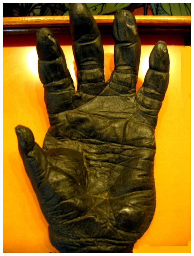
Actual gorilla hand used to make "ashtrays" in the 1950s and 60s.

In the course of working on this case, it came to mind that the impression was probably made using a real gorilla hand (previously used for an ashtray). Joedy thoroughly researched everything and does not believe the lady's brother fabricated the hand print. Whatever the case, it was decided that the print was fabricated, so the cast was not included in museum exhibits. The following pages show photographs and illustrations. It was an interesting case and does provide insights on the things that can happen.