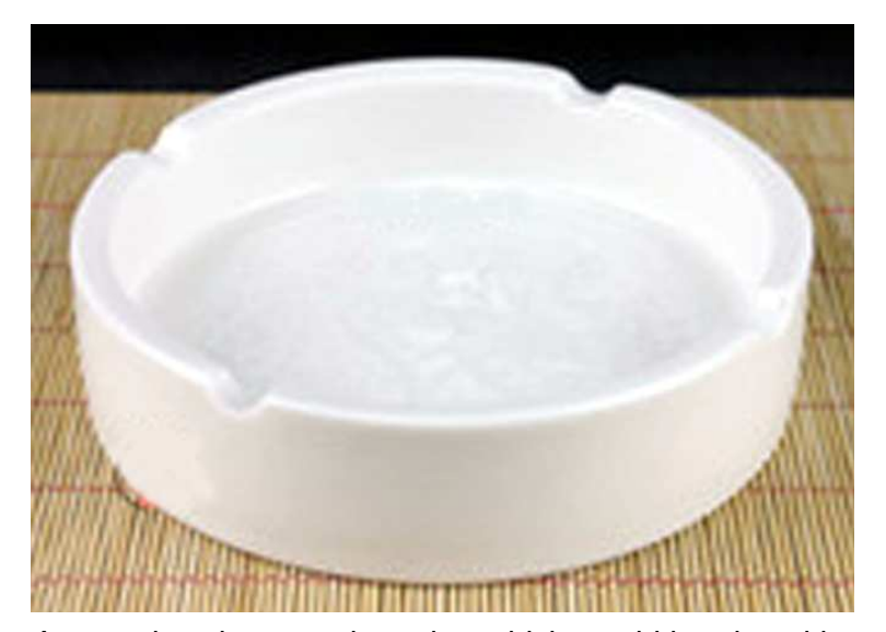
A ceramic ashtray such as that which would be placed in a real gorilla hand to result in a "gorilla hand ashtray." Taxidermy was quite popular in those days, but has now "fallen from grace."