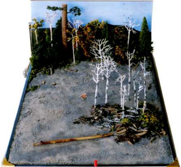
A scale model of the film site. The scene shows the point at which the image of the creature shown on page 3 was taken.

the prints (a left and right footprint) and then left to have the film shipped for developing. They could not be sure that they actually captured the creature on film and wanted to confirm this before they left the area. They planned to stay longer and try again to film a bigfoot if