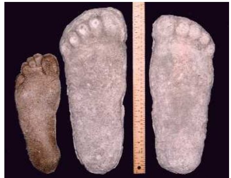
Film site casts with cast of a human foot.

detailing all their findings, 2 Nevertheless, without bones or a body part, the “world of science” essentially stayed clear of the issue.