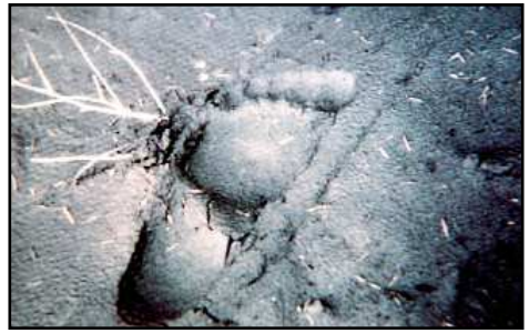
Note the twig. Might this indicate a real foot made the print?