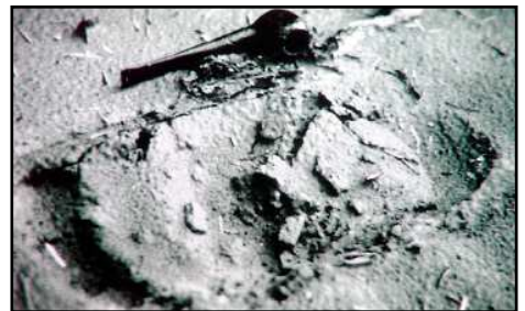
A smoking pipe was used for size comparison.

These photos were taken October 23, 1967 of actual footprints made by the creature filmed. Five days later, October 28, 1967, casts were made of ten of the prints by a researcher following up on the sighting.