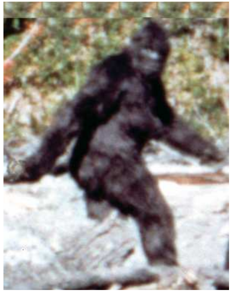
A film frame close-up showing the creature as it turned and looked at Patterson and Gimlin. (Public domain)

Two prominent Russian researchers, Dmitri Bayanov and Igor Burtsev thoroughly studied and analyzed the film in the early 1970s and later years. They concluded that it definitely showed a living homin. Much later they published a book