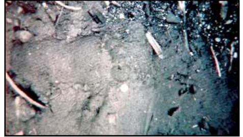
An American 25-cent coin was placed near the big toe for size comparison.