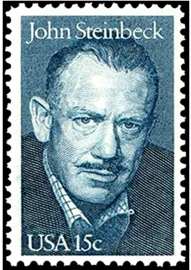
John Steinbeck (1902 – 1968), Postage stamp shown is USA Scott No.1773, issued February 27, 1979.