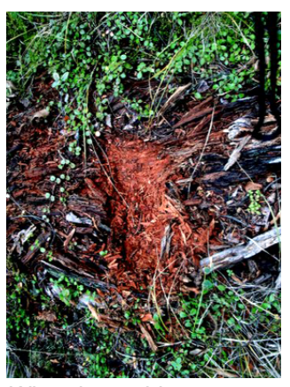
What the resident believes was a footprint made by the subject.