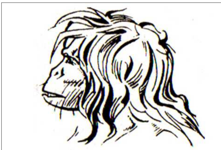
Drawings of an almasty based on and eyewitness account.

who in treating some of the Mongols in a very remote area, met an almas family, so there seems to be no doubt the creatures are there. They seem to be rather short, stocky, and to be very shy, and it's also mentioned in many stories that they are rather hairy and have very primitive clothes. In this respect the description of Neanderthal man fits the almas really quite well.