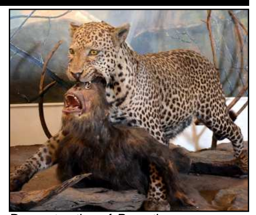
Reconstruction of Paranthropus robustus being dragged by a leopard at the Ditsong Museum, Pretoria.

after it was determined that a Paranthropus had apparently been killed by a leopard. I believe the inference is that the hominoid was particularly vulnerable to animal attacks, and likely attacks by other