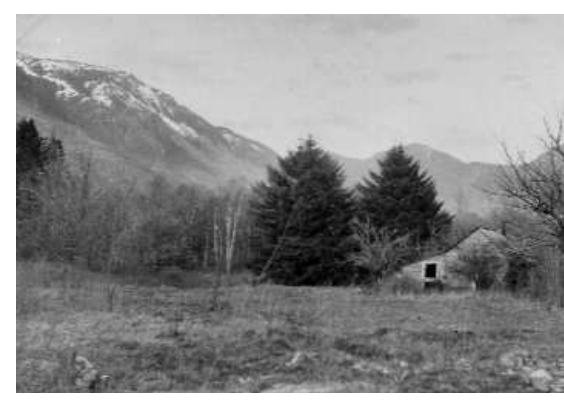
Distant view of the old house.