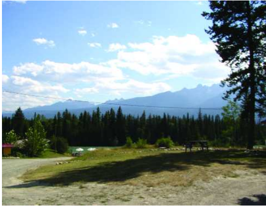
The long sloping mountain seen in the immediate background is Mica Mountain. Other than new highways, the area is essentially the same now as it was in the 1950s.