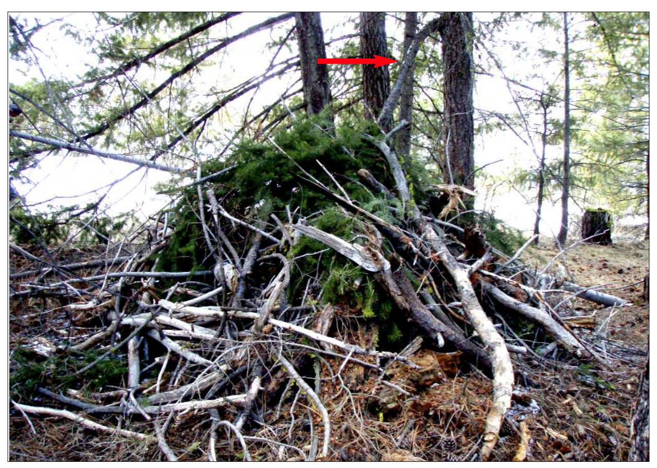
Left side view showing the pulled-down branch.