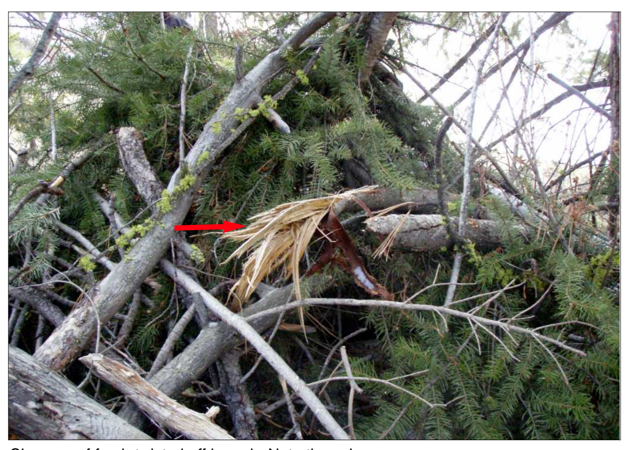
Close-up of fresh twisted-off branch. Note the color.