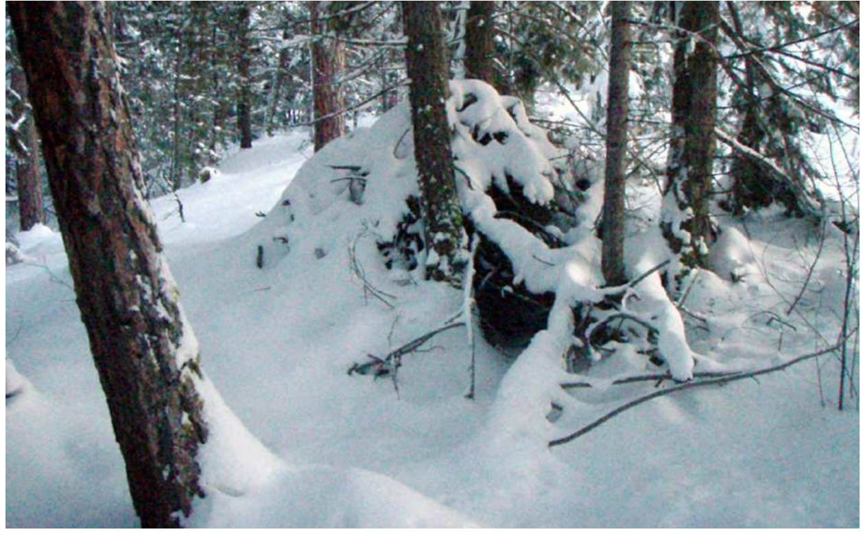
Winter photo—note how the snow makes the structure like an igloo.