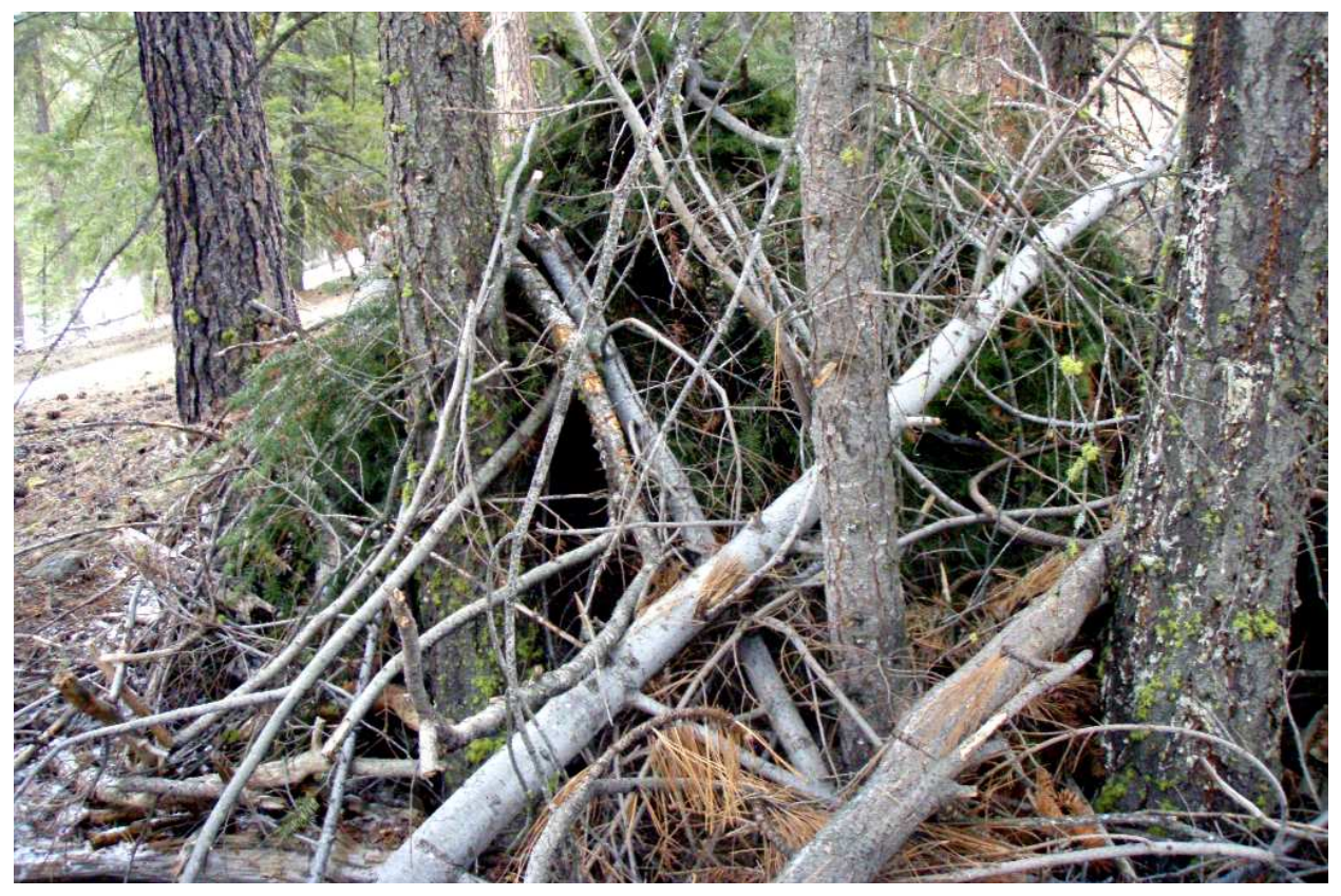
Front right view.