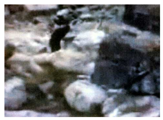
What might be a homin seen in Poland, although not beyond a fabrication. The last image gives the impression of the subject sort of "slinking" (move smoothly and quietly with gliding steps, in a stealthy or sensuous manner), which would likely be appropriate.